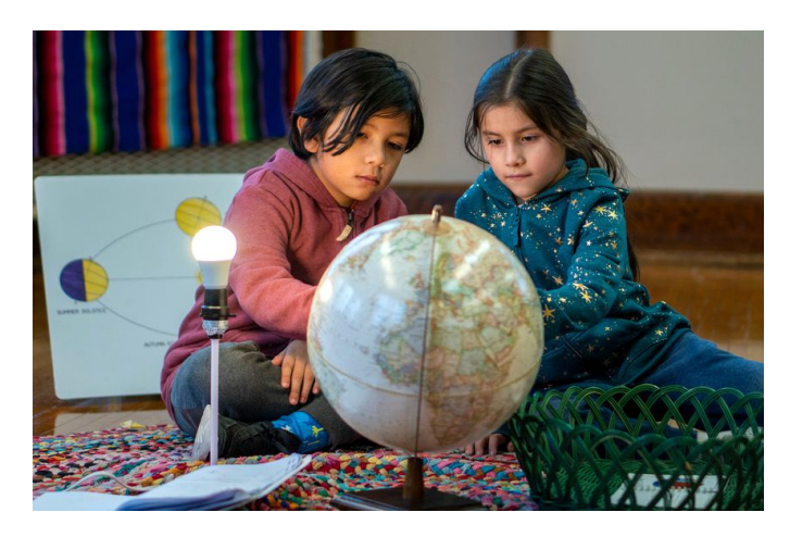
Geography Grab-n-go Bins

Established ready-access bin system with materials necessary for teacher-led lessons and student-led experiments