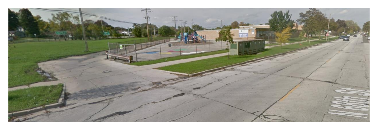
View of N. 68th Street Entrance