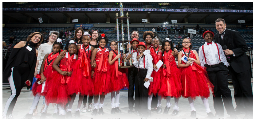
Bruce Elementary was the Overall Winner of the Mad Hot Tap Competition, held January 25 at the BMO Harris Bradley Center.

Danceworks has delivered high-quality ballroom and tap dance programs to MPS students for more than 11 years. Through the Mad Hot program, hundreds of children gain access to formal dance training--most of them have never been in a dance class before. Students develop confidence and showmanship while also experiencing the value of practice and hard work. Students take a one-hour class twice weekly during the fall semester (at no cost, thanks to generous funders) and they learn routines for each style of tap dance in preparation for the competition.