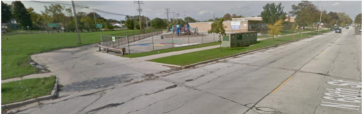
View of N. 68th Street Entrance