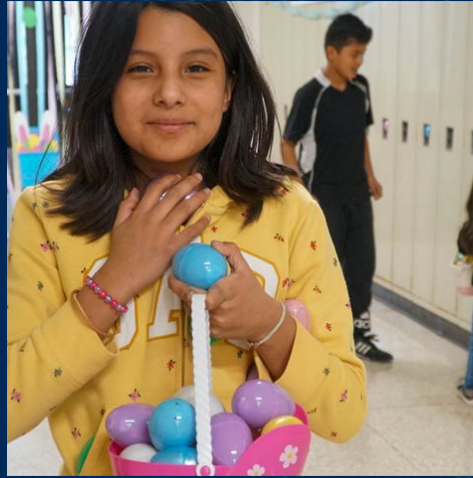
Spring Egg-stravaganza March