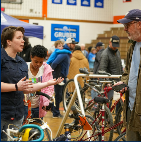
Bike Bazaar March