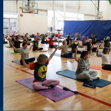
Yoga Fest New Year's Day