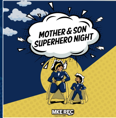
Mother & Son Superhero Night November