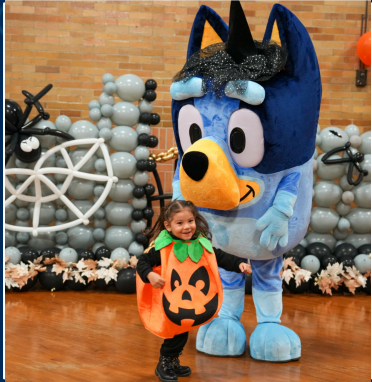
Twilight & Treat October