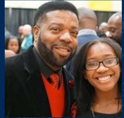
Daddy Daughter Dance February