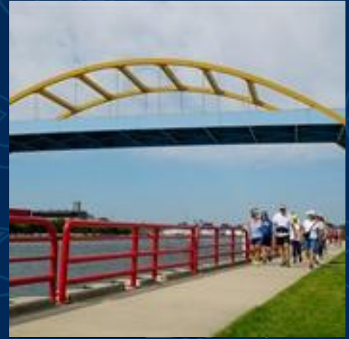
414 MKE Wellness DAY April